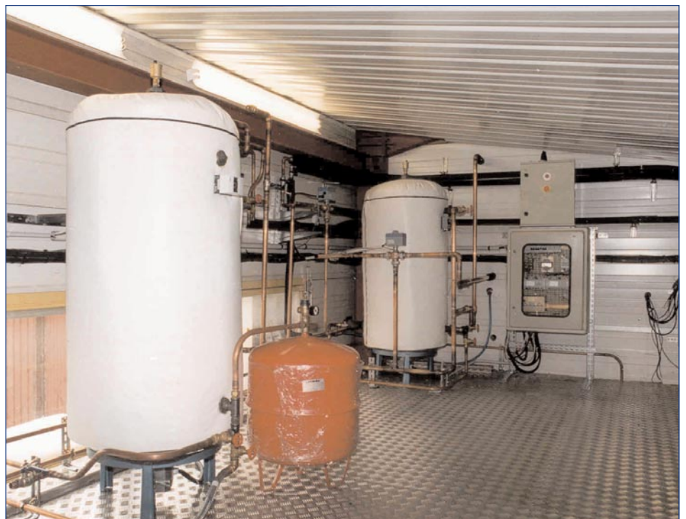
Absorption heat pump

The SOLHEATCOOL project has aimed to demonstrate this technology under European conditions where, as yet, no manufacturer of such systems exists.