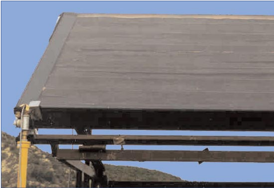
C8 Solar collector prototype

is essential that the solar collectors supply water at relatively high temperatures, of approximately 80°C. Thus they need to be of an efficient design, but should not be too expensive. Two types of solar collector were assessed: evacuated-tube collector arrays and efficient flat plate collectors.