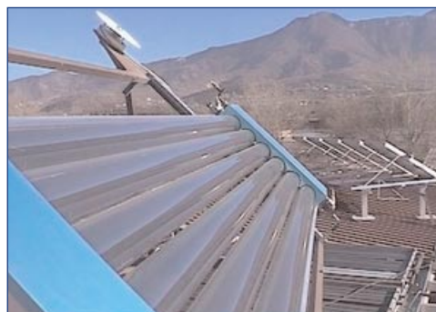
CORTEC Solar collector prototype

global warming through greenhouse gas emission resulting from the burning of fossil fuels in electricity generation. The use of CFC gases that can escape to the atmosphere during manufacture, operation and disposal of conventional air-conditioning systems also poses a significant environmental risk.